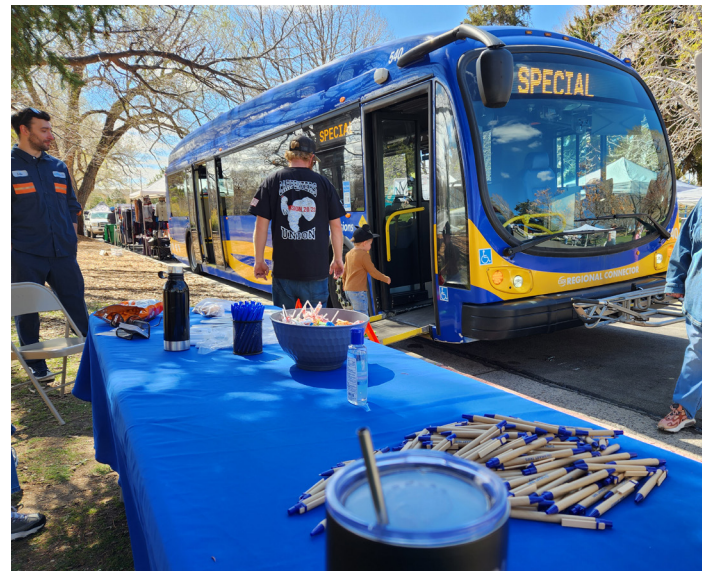
EARTH DAY - SMART TRIPS