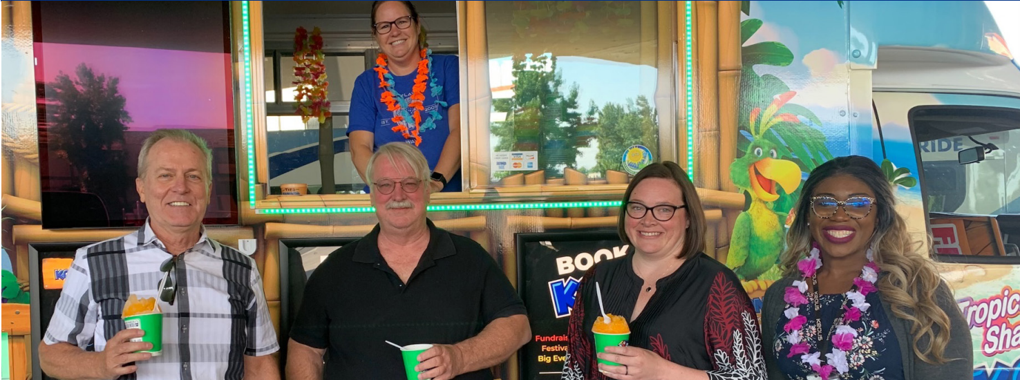
NATIONAL BEACH DAY

National Driver Appreciation Day – Keolis kicked off the celebration on St. Patrick’s Day with green donuts, cupcakes and cookies for the staff. MTM, sponsored a breakfast for its staff the same day. Keolis wrapped up the celebration by having Kenji’s Food truck on site for a staff luncheon on Monday, March 20. RTC delivered over 300 individually wrapped bundlets to Keolis and MTM staff from Nothing Bundt Cakes.