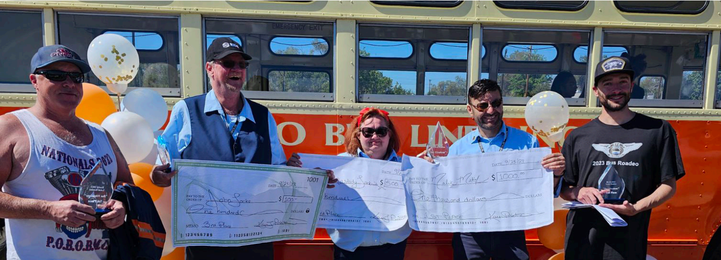
BUS ROADEO EVENT