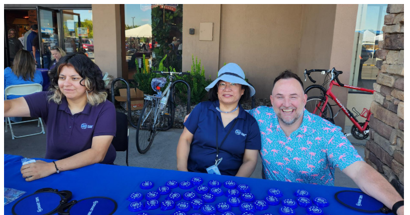
SENIOR FEST EVENT