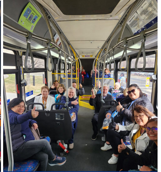
SENIOR DAY LEGISLATURE