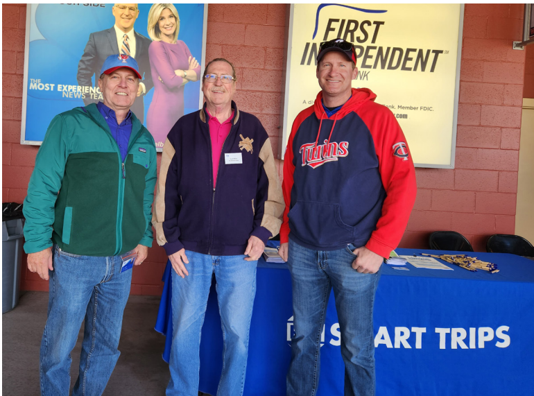
ACES GAME - SMART TRIPS